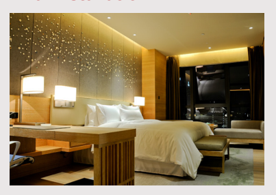
Bridgelux Arrays and Final Fixtures